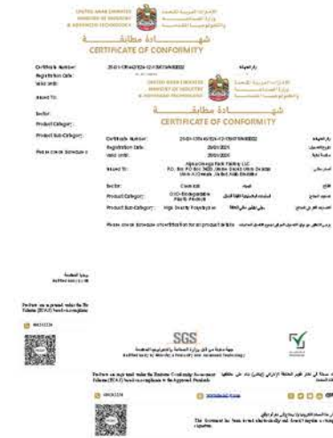
Certificate of Conformity for LDPE and HDPE