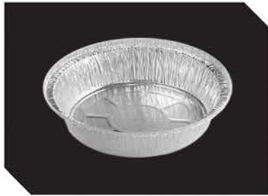
7 Inch Round