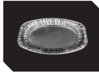
35 cm Platter