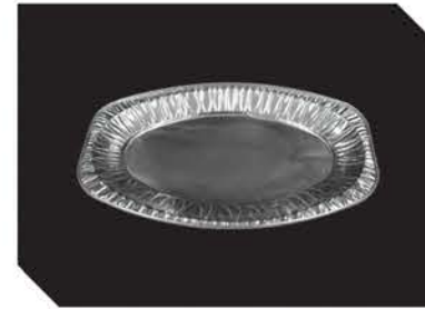
45 cm Platter