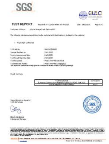
SGS Test Report for Aluminum Containers for EU 2020/1245