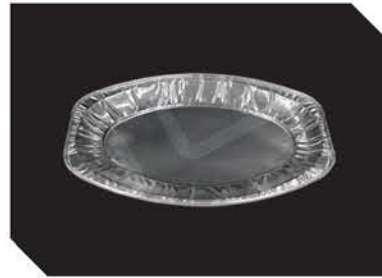
33 cm Platter