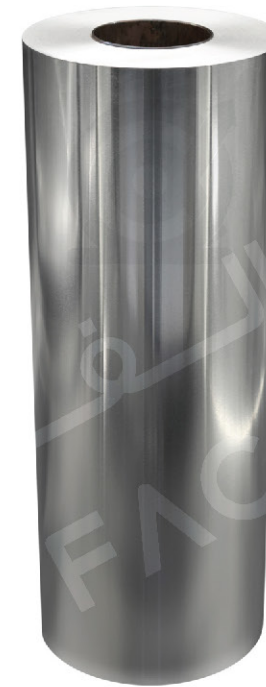
Jumbo Roll 45 cm