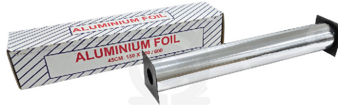
Unbranded Retail Pack 45 cm