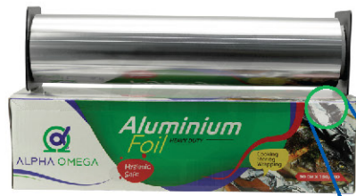
Branded Retail Pack 30 cm