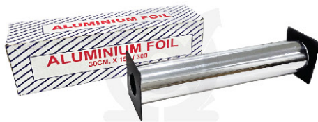
Unbranded Retail Pack 30 cm

Our standard packaging is equipped with a Metal Serrated Blade