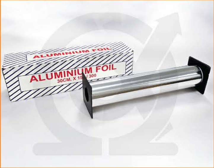
Unbranded Retail Packs