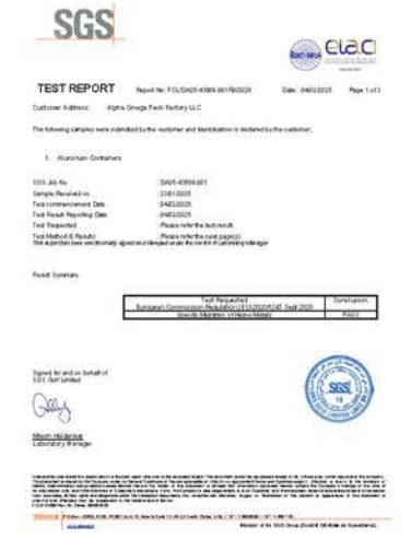
SGS Test Report for Aluminum Containers for EU 2020/1245