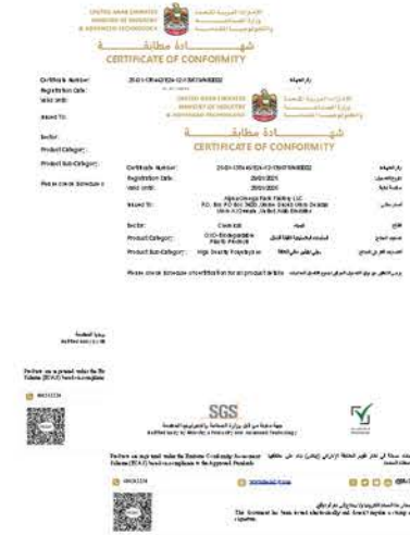
Certificate of Conformity for LDPE and HDPE