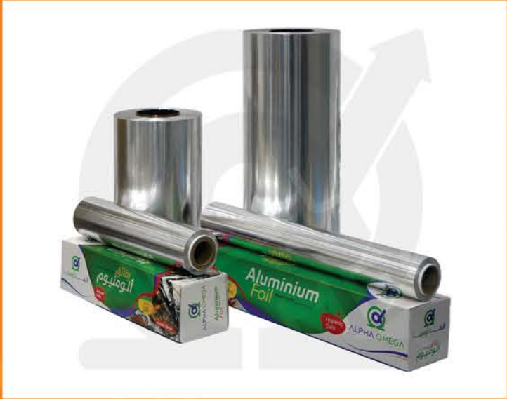
Branded Retail Packs, and Jumbo Rolls