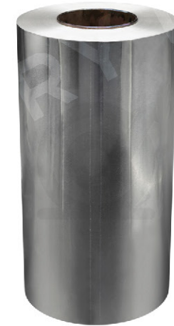
Jumbo Roll 30 cm