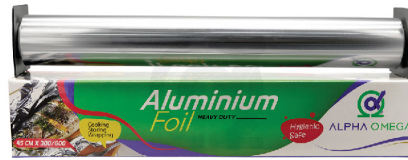
Branded Retail Pack 45 cm