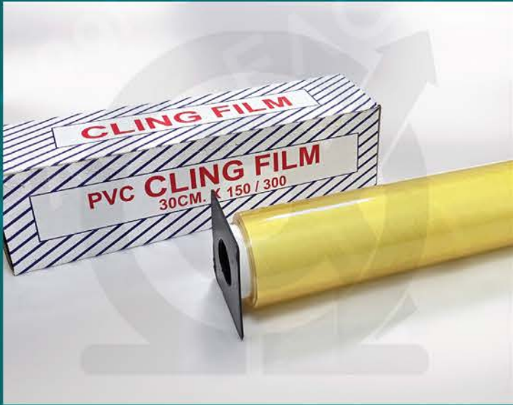
Unbranded Retail Packs