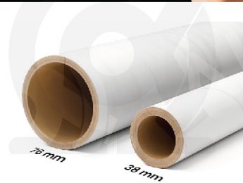
Core Inner Diameter