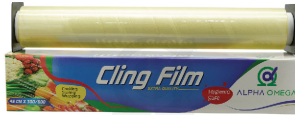
Branded Retail Pack 45 cm