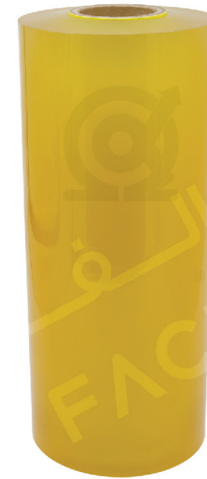
Commercial Roll 30 cm / 45 cm