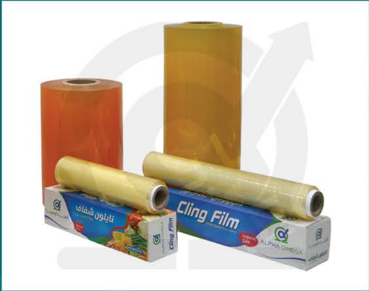
Branded Retail Packs, Commercial Rolls, and Jumbo Rolls