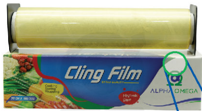
Branded Retail Pack 30 cm