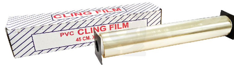
Unbranded Retail Pack 45 cm