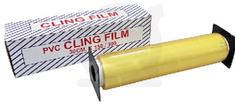
Unbranded Retail Pack 30 cm

Our standard packaging is equipped with a Metal Serrated Blade