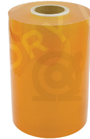
Jumbo Roll 30 cm / 45 cm